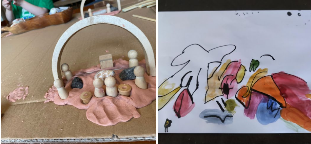
Figure above left “I made a rainbow and a box and a slide in the park.” (Landscape creation activity)

Figure above right “I’m at the park and this is me and this is my Daddy and I was skipping and these are the things I was climbing on.” (Community painting activity)