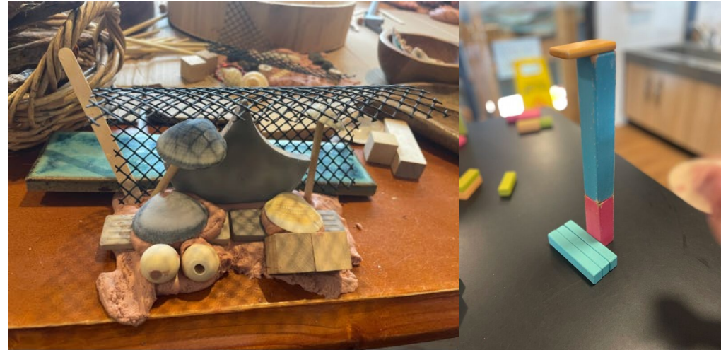
Figure above left “I made a boat and a beach.” (Landscape creation activity)